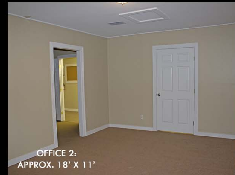
OFFICE 2: APPROX. 18' X 11'

Commercial building located just off of the corner of East Alamo and Chappell Hill Street. Building has 1426 SF with 20'X30' lobby/reception area and two large offices. Recent updates include 30 year comp shingle roof, CHA, hardi-plank front with new windows. Property is zoned B1.