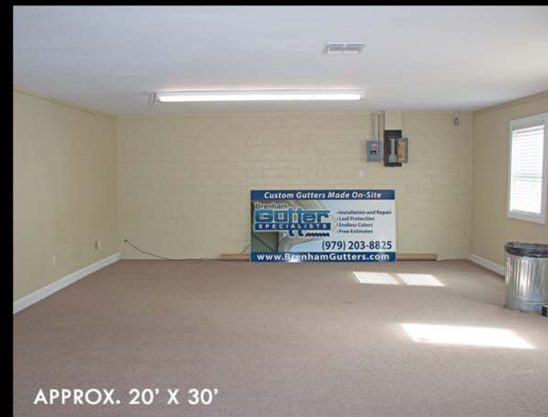
APPROX. 20' X 30'