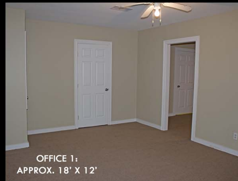
OFFICE 1: APPROX. 18' X 12'